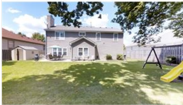
Family Friendly Backyard w/Enclosed Privacy Wooden Fence. Storage shed remains with property & swing set. Mature Trees and Very Private. See 3D Tour for in depth view.