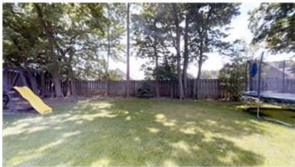
Mature Trees backed up to residential Very Private Large Spacious Backyard. Enclosed Privacy Wooden Fence. Swingset stays.. See 3D Tour for in depth view.