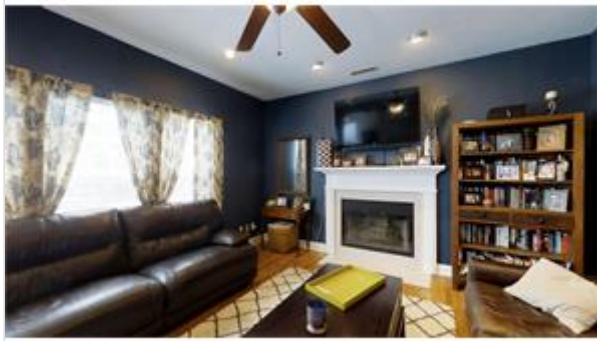
Great room with Ceiling Fan. 9ft Ceiling. Wooden Style Floors. Gas Fireplace. 3 sets of windows to backyard. Custom Wall Simply Beautiful!