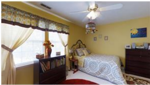
5 Bedrooms total: Guest Bedroom w/ceiling fan. New Paint. Walk in closets.