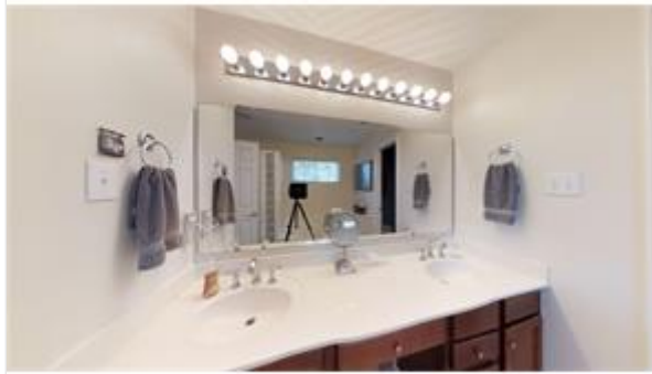
Master Bathroom: Dual sinks and overhead lights. Plenty space.