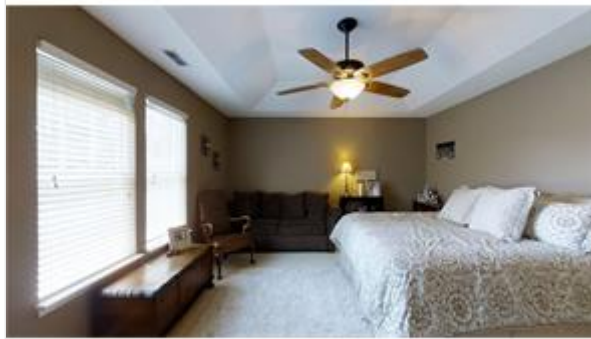
5 Bedrooms total: Very Spacious w/Tray Ceiling & Fan. New Paint and large Closet.