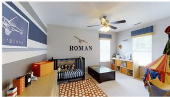
5 Bedrooms total: Beautiful boys bedroom. New paint. Simply Stunning. Walk in Closets