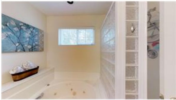
Master Bathroom: Garden Jacuzzi tub and shower.