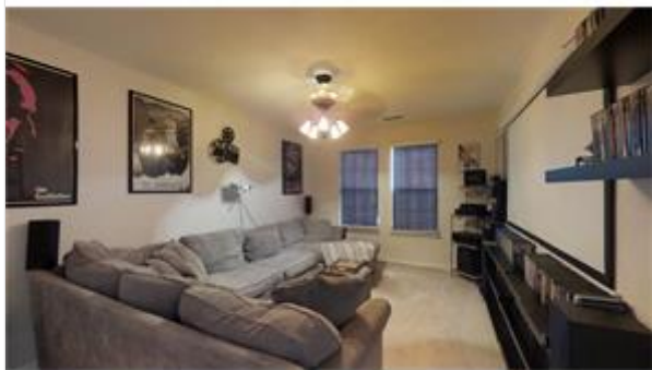
5 Bedrooms total: Theater room. This has everything ready to Go!! Walk in Closets. See 3D Tour for in depth view.