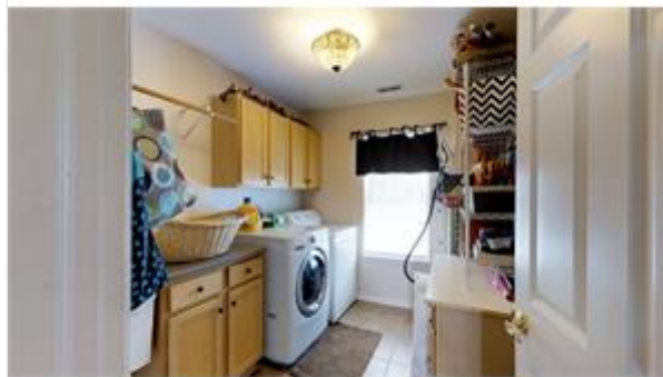
Laundry Room Upstairs w/ wash tub & sink. Draft desk also.