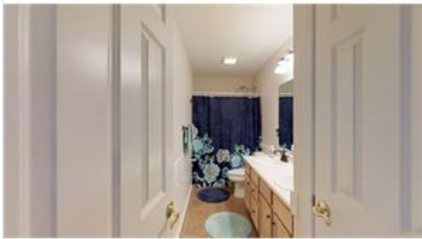
2nd Bathroom. Dual sinks with tile floors.. Very accomating for large families