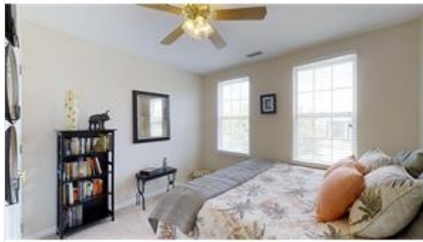
5 Bedrooms total: Guest bedroom w/ceiling fan & carpeting. Walk-in Closets